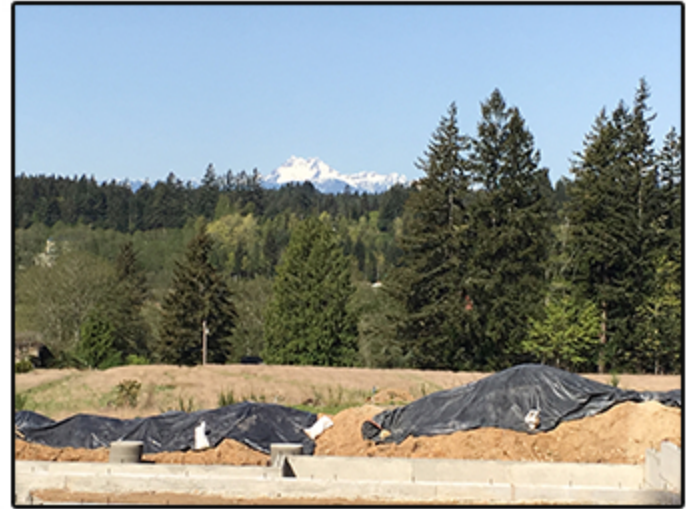
OLYMPIC VIEWS + Foundation

HUGE 30,000+ SF Lot with a Beautiful View of the Olympics Mountains Approximately 2550 SF of Living Space and an Oversize 3 Car Garage 3 Bdrm, 2.5 Bath (Optional 2 Bedroom W/Large Den) HUGE Covered back Porch Rare Close-in Silverdale Location, only a 5 minute walk to the Kitsap Trail System.